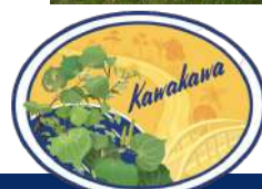
Kawakawa Y4/5 Kawakawa Y6