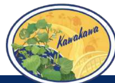
Kawakawa Y4/5 Kawakawa Y6